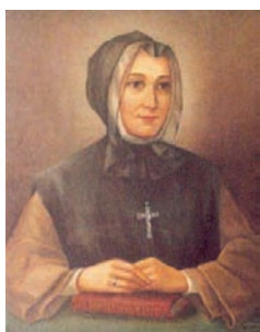
Saint Marguerite d'Youville (October 15, 1701 – December 23, 1771)

In 1970, the Church gave her the title she had long held in the popular mind: Doctor of the Church. She and St. Catherine of Siena were the first women so honored. (From franciscanmedia.org )